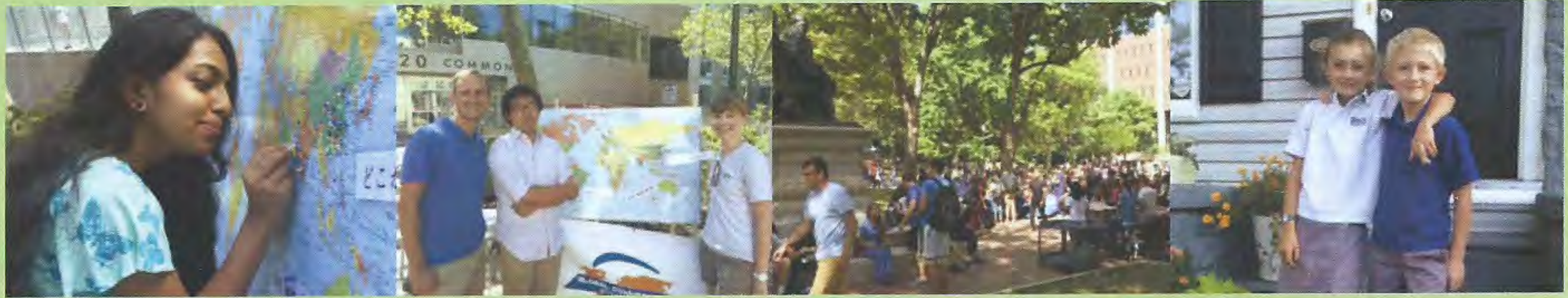
A Penn student from India