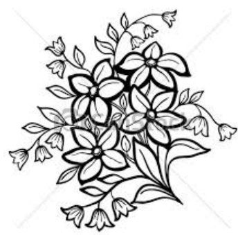
© Can Stock Photo - csp13256709